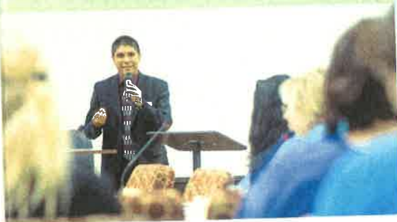
Visiting speakers discuss topics of local interest.