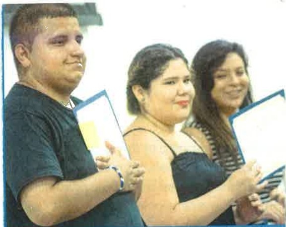
Local youth honored at BHAB meeting for their advocacy efforts.